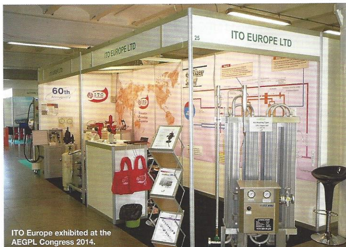
ITO Europe exhibited at the AEGPL Congress 2014.