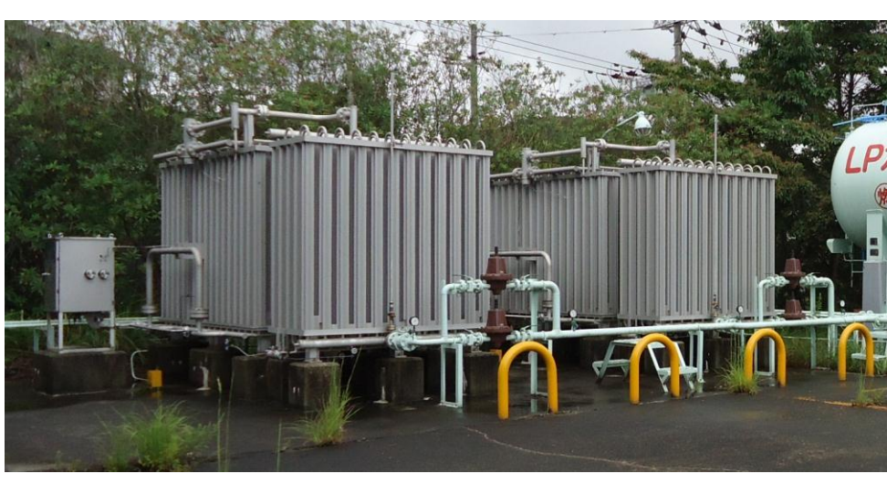
The Most Eco-Friendly Vaporizer Available - see Page 2