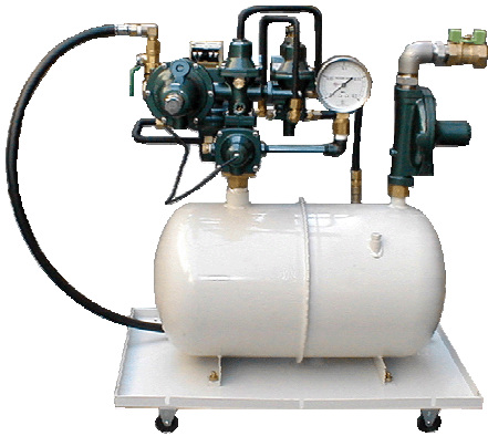
ITO KOKI's PA System for synthetic gas production (Currently under test by BSI)