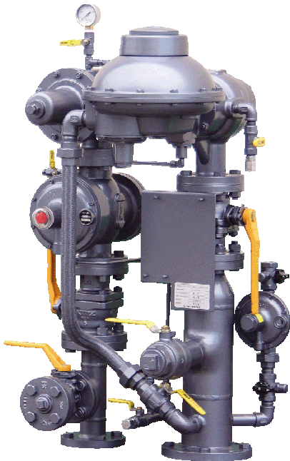
REGIT Natural Gas Governors