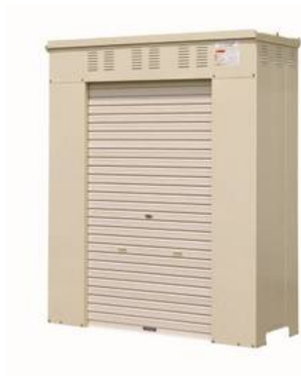
Cylinder Storage and Metering Systems