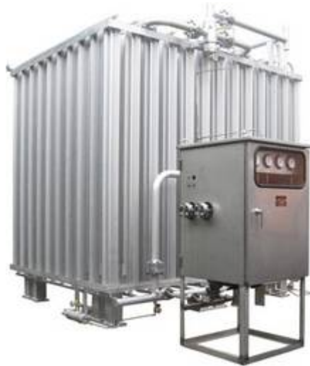
Vaporizers Hot Water Type, Electric Type and Air Heating Type